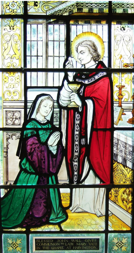
Image of a stained glass window in Harvington Hall