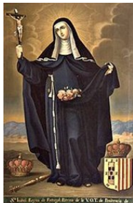
Portrait by José Gil de Castro