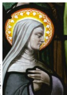
Stained glass window Ss Mary & Modwen Church Burton-upon-Trent

Elizabeth was the daughter of King Peter III of Aragon and was named after her great aunt, St Elizabeth of Hungary, whose virtues she also inherited. In her married life with King Dennis of Portugal, she endured trials with heroism. On more than one occasion she went to considerable pains to bring peace between her children and their father. After her husband's death she became a Franciscan Tertiary and showed unflinching charity towards the poor.