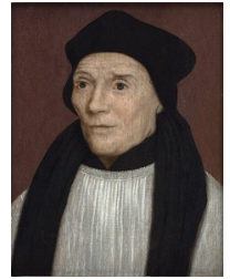
Hans Holbein (1497/1498-1543)

St John Fisher (1469-1535) studied theology at Cambridge and became Bishop of Rochester. His friend, Thomas More, wrote of him 'I reckon in this realm no one man, in wisdom, learning and long approved virtue together, meet to be matched and compared with him.'