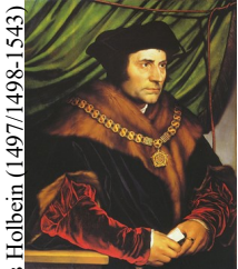
Hans Holbein (1497/1498-1543)

St Thomas More (1477-1535) was born in London and was Chancellor of King Henry VII. As a family man and a public servant, his life was an expression of a rare synthesis of human sensitivity and Christian wisdom.