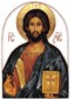
"Where two or three come together in my name, there I am with them." Matt 18:20