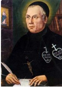
Blessed Dominic Barberi 1792 – 1849 Passionist • Apostle of England

The annual Diocesan Novena of Prayer for the Cause of Canonisation of BLESSED DOMINIC BARBERI begins on Wednesday 11 th March and concludes on Thursday 19 th March.