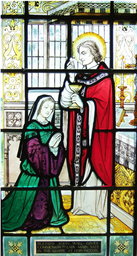
Image of a stained glass window in Harvington Hall

http://www.sjw.bham.sch.uk/index.php/catholic-life/sjw